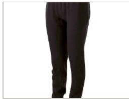
Ladies Jogger $25.00