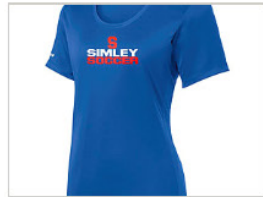
Blue or White Women's Performance Tee $17.00 - $21.00