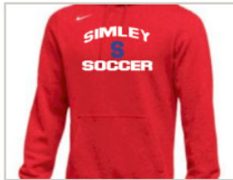
Nike Red Hoodie - Includes personalization on shoulder $59.00