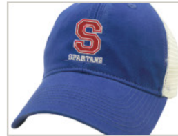
Relaxed Twill Trucker $25.00