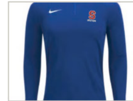
Nike 1/4 Zip - Men's and Women's Cut $57.00