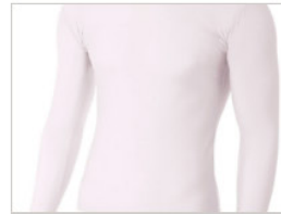
A4 Long Sleeve Compression Crew $20.00