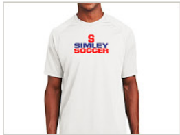
Blue or White Men's Dry Zone Tee $18.00 - $22.00