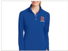
Men's and Women's 1/4 zip $40.00 - $45.00