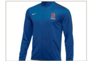
Nike full Zip - Men's and Women's Cut $55.00