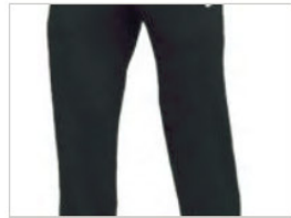
Men's and Women's Nike Fleece Pant $38.00